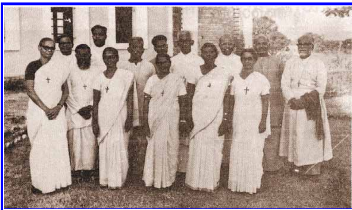
Sihora Ashram Family 1974